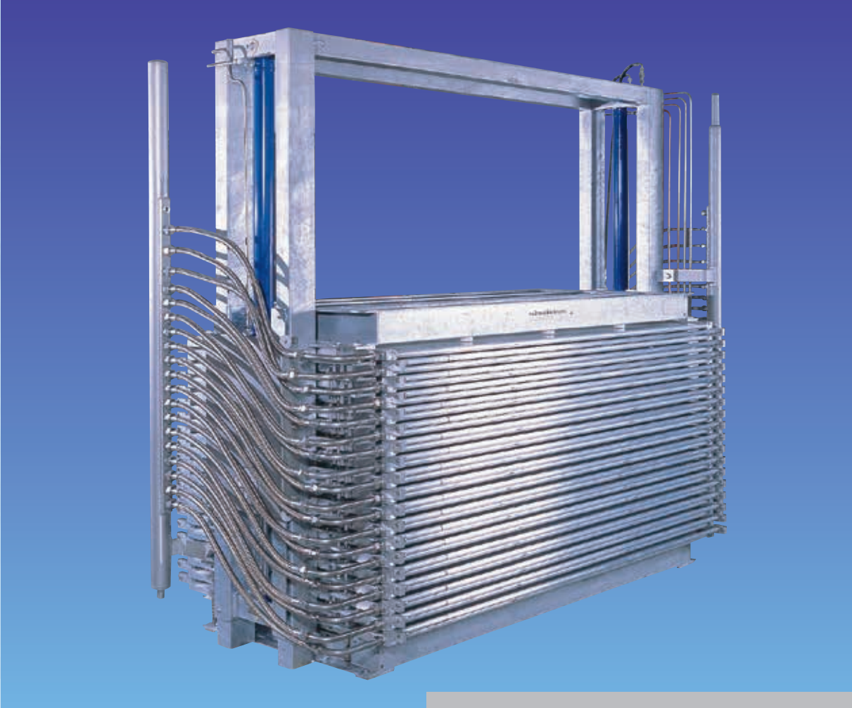
DSI Horizontal Plate Freezers