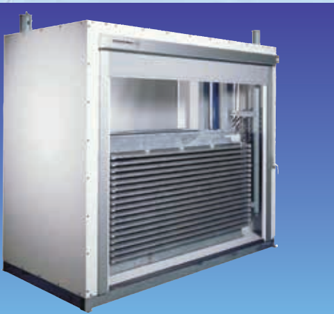
DSI Horizontal plate freezer with cabinet.