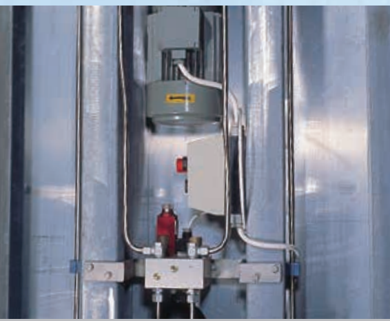
Hydraulic system, type Power Pack, mounted on horizontal plate freezer.